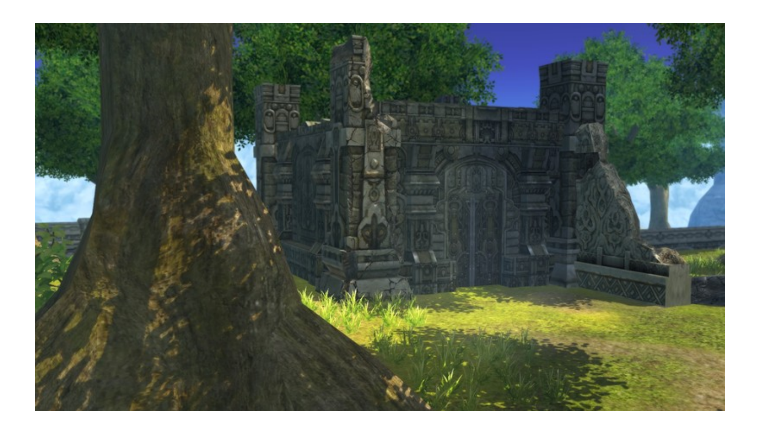
Tales Of Zestiria - Adventure Items Download Uptodown

Download ->>->> <a href="http://bit.ly/2SJpWkx">http://bit.ly/2SJpWkx</a>